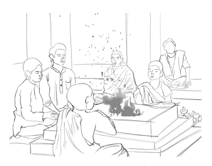
Figure 1: Yagya being performed.